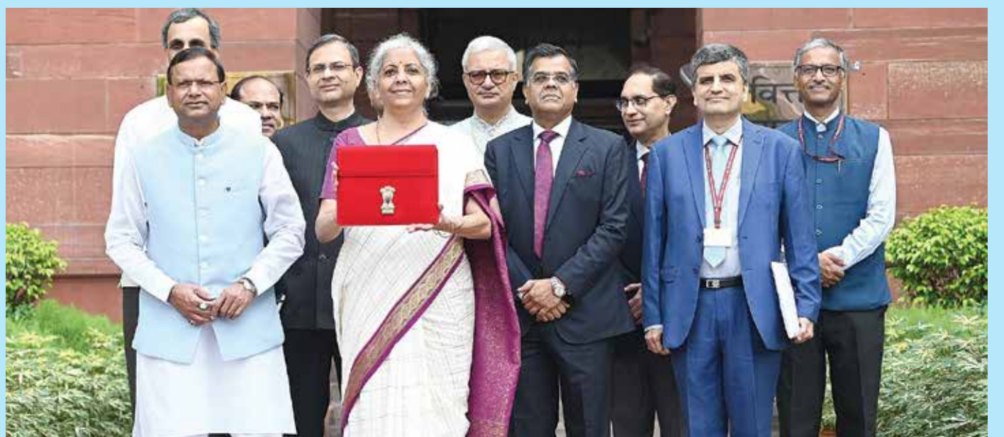
Union Finance Minister Smt. Nirmala Sitharaman & her team.

The Union Minister informed that the Government will facilitate higher participation of women in the workforce through setting up of working women hostels in col-