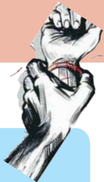
Sushmita Belde Entrepreneur Hyderabad

India's safety for women remains a critical issue, requiring more than protests and campaigns. Key actions include: Strengthen law enforcement and judicial reforms, Challenge patriarchal attitudes and stereotypes, educate on consent and boundaries, develop reliable helplines and victim support services, involve local communities in safety efforts, enforce laws protecting women's rights, promote women's economic and social empowerment, utilize technology for emergency response, Engage men as allies, continuously assess and improve safety measures.